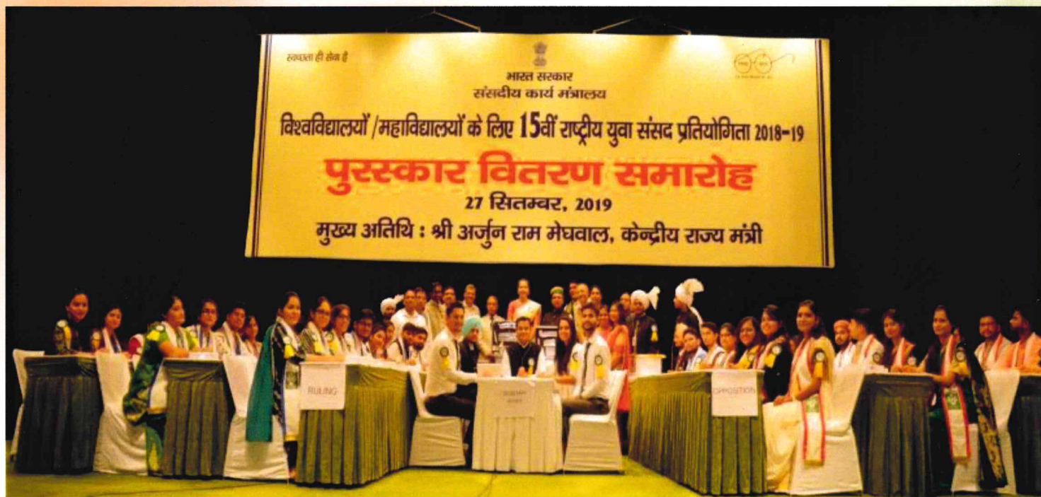
[Students of Central University of Punjab, Bathinda along with Sh. Arjun Ram Meghwal , Hon'ble MoS and other dignitaries on the occasion of the Prize Distribution Function on 27.09.2019.]